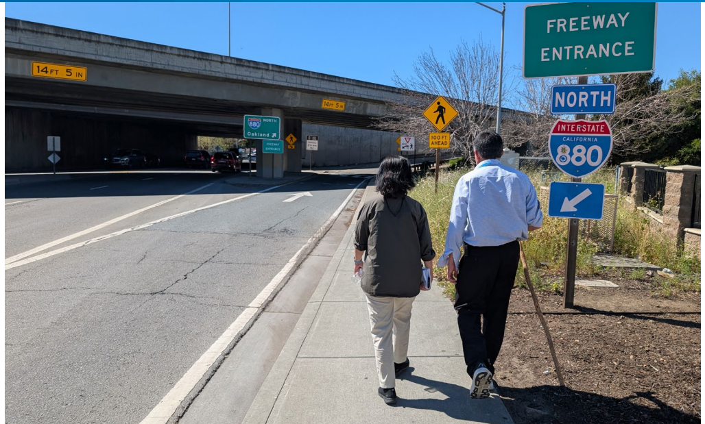
4CP walking tour on Lewelling Blvd in San Leandro.