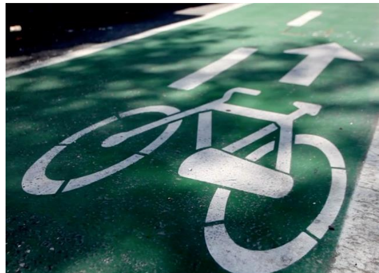
High visibility bike markings.