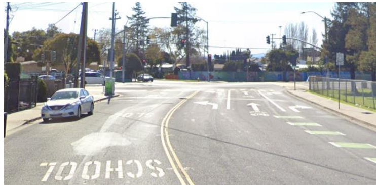
Whitman Street at Tennyson Road.