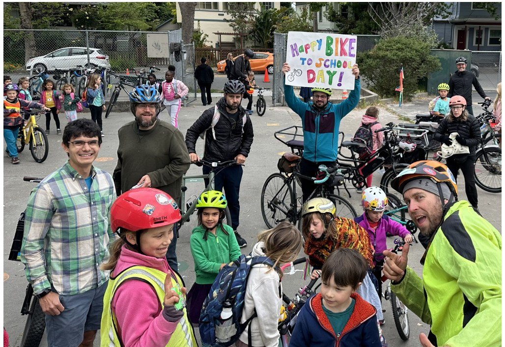
Bike to School Day 2025, Malcolm X Elementary School in Berkeley.

Area's biggest day for biking, Bike to Wherever Day (formerly Bike to Work Day), which offers community events and free bike classes throughout the month of May. This year, ten SR2S participating high schools hosted Energizer Stations in partnership with Bike East Bay to distribute 200 commemorative tote bags and festive resources and giveaways. This growing collaboration highlights SR2S efforts to encourage the next generation of active and shared transportation users. Learn more about this year's event here .