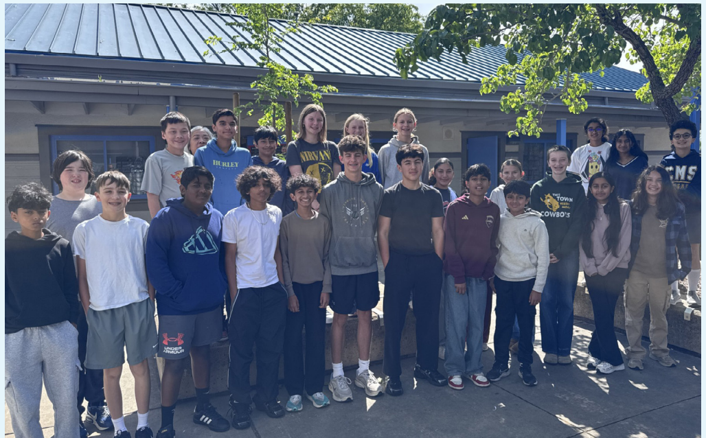
Students at Christensen Middle School in Livermore, winner of the 2026 Platinum Sneaker.

More than 15,500 students from over 88 schools participated in this year's Golden Sneaker Contest, a countywide initiative hosted by Alameda CTC's Safe Routes to Schools (SR2S) Program. Each spring, this initiative encourages students to walk, bike, roll, carpool or take transit to school to promote safer travel, reduce congestion and emissions near schools, and support student health and physical activity. Participants earn points for using active and shared transportation modes, with classrooms tracking participation throughout the two-week event.