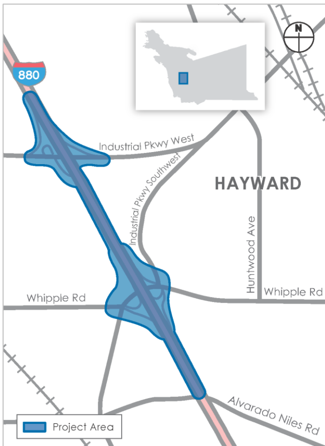
Aerial map of project location. (For illustrative purposes only.)

Due to their close proximity, improvements at both interchanges are being developed as a single project.