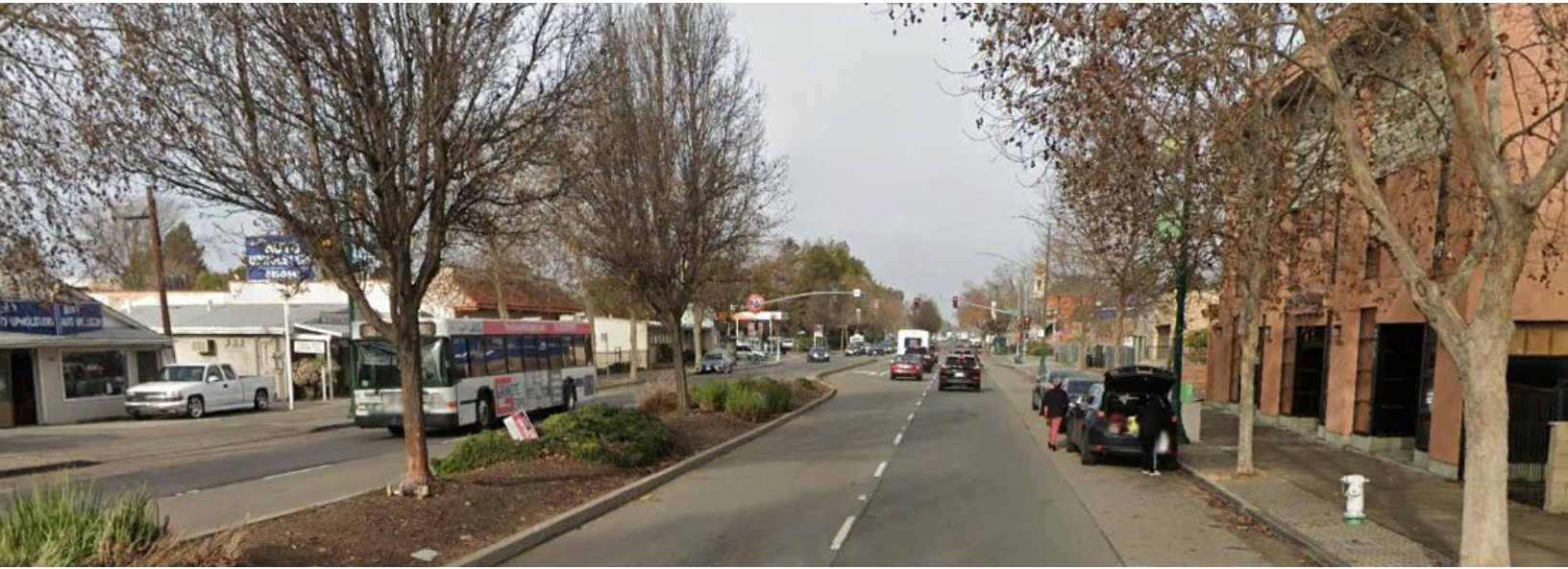
East 14th Street in Alameda County.