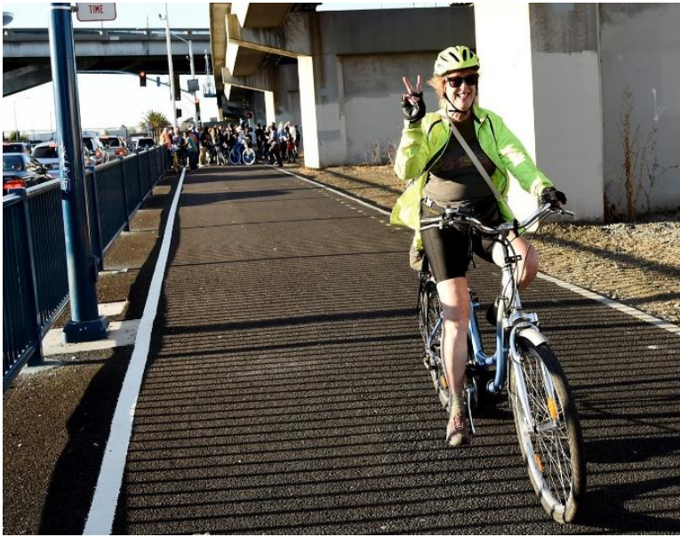
Initial East Bay Greenway segment from Coliseum BART to 85th Avenue (funded by Measure WW, TIGER and BAAQMD).