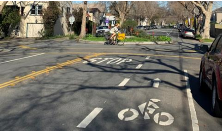
Existing bike boulevard route showing roundabout and crossing treatment.