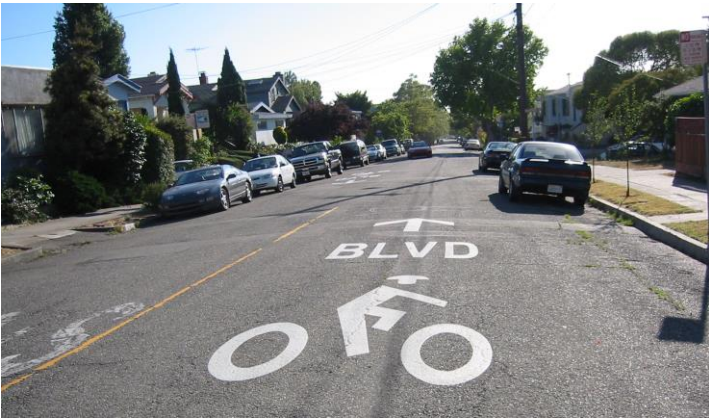
Bike Boulevard in the cities of Berkeley/Albany.