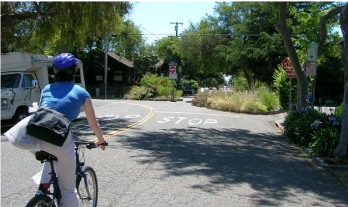
Example diverter treatment.