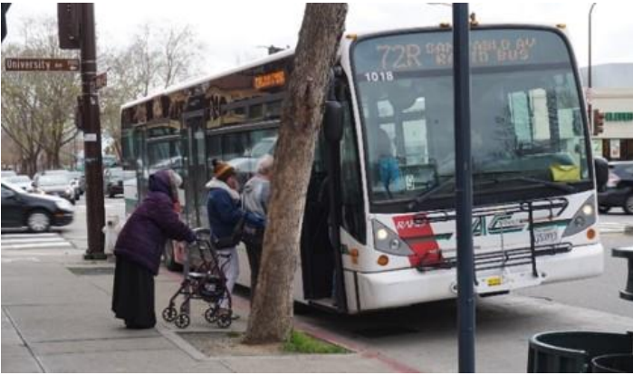
Current AC Transit Rapid Bus along San Pablo Avenue.