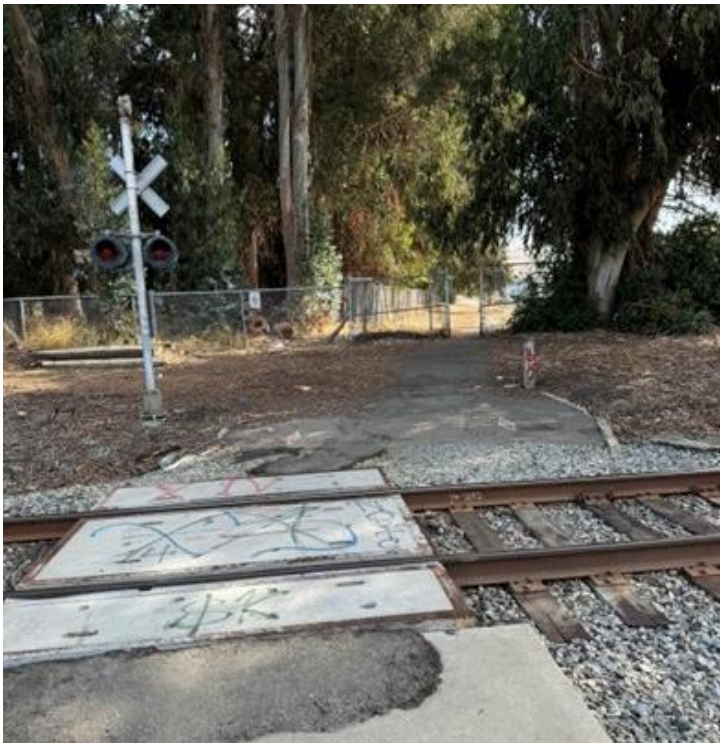
Tennyson High School Pedestrian (train track) Crossing in the City of Hayward.