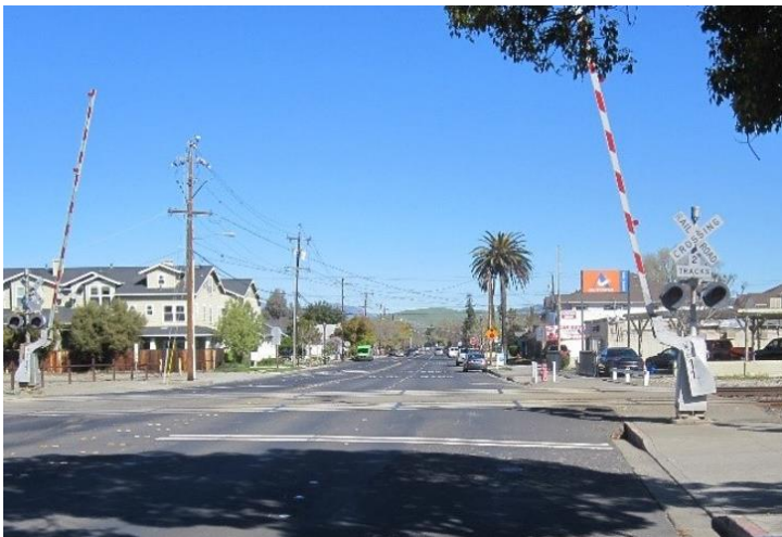
Rail crossing on L Street in the City of Livermore.