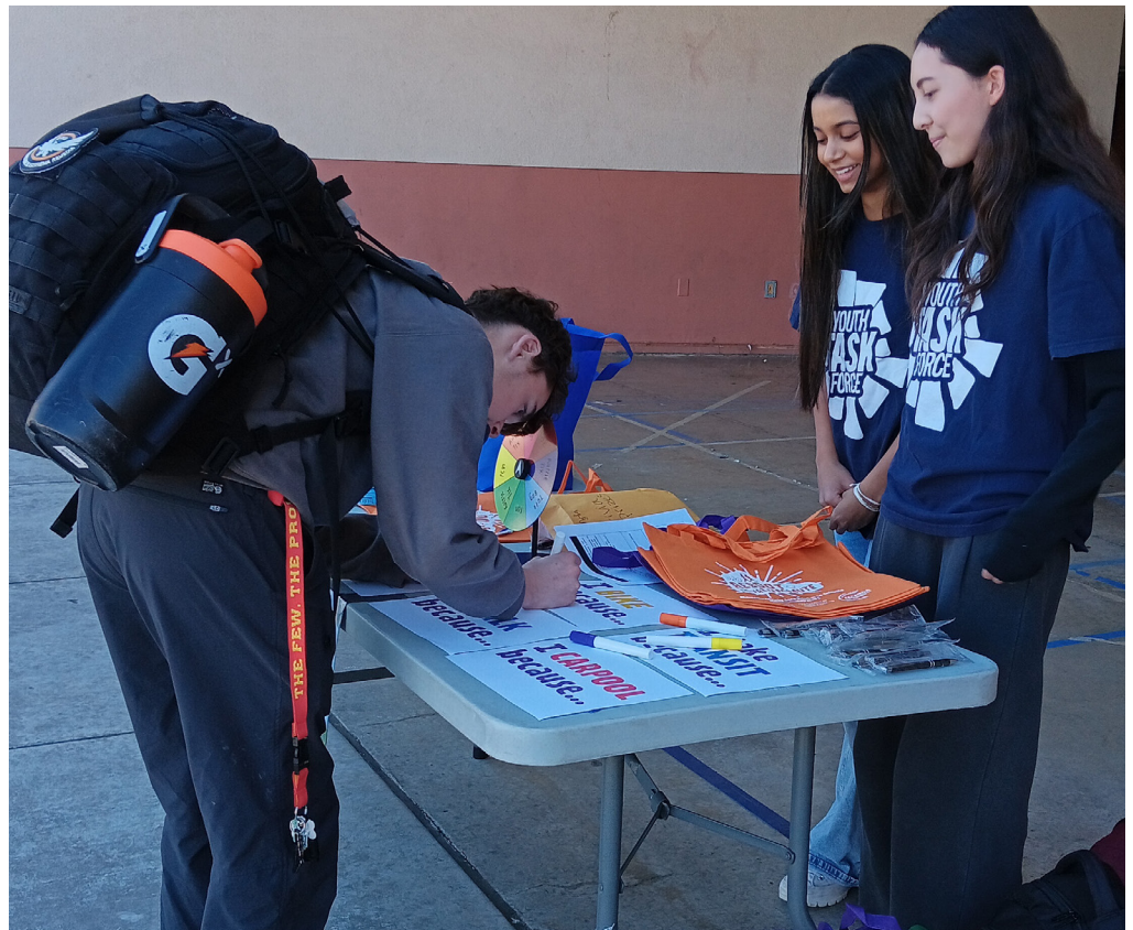
Washington High School (Fremont) students host a Reboot Your Commute event in 2025.

( alamedacountysr2s.org/our-services/plan-an-event/reboot-your-commute/ )