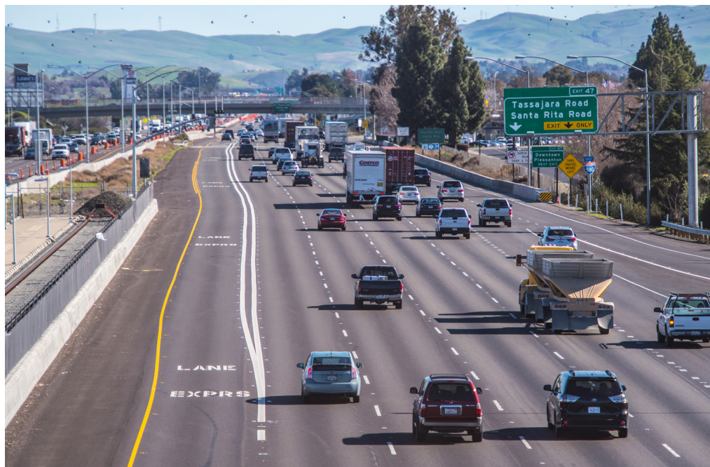
The I-580 Express Lanes are now generating net revenue.