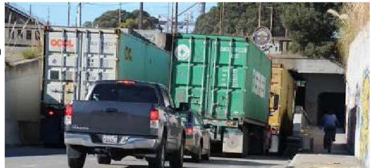
Existing 7th Street underpass with low clearance and lane width