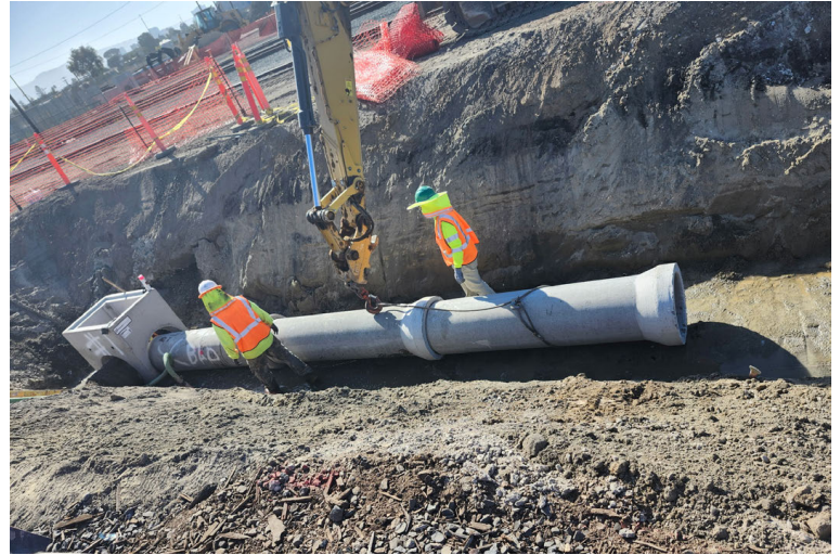
Storm Drain being installed alongside new 7th Street alignment.