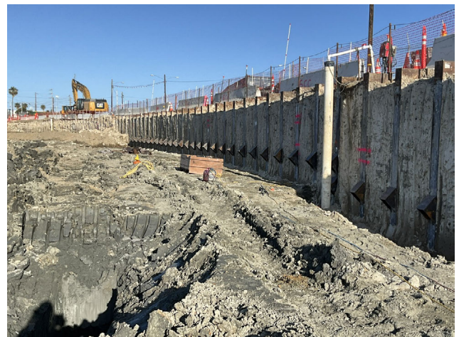
Tieback walls being installed alongside excavation.