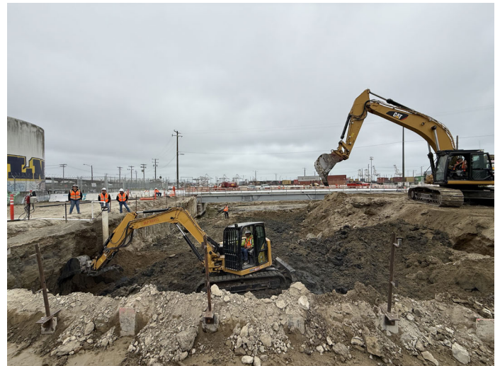
Ghilotti crews excavating the new alignment of 7th Street.