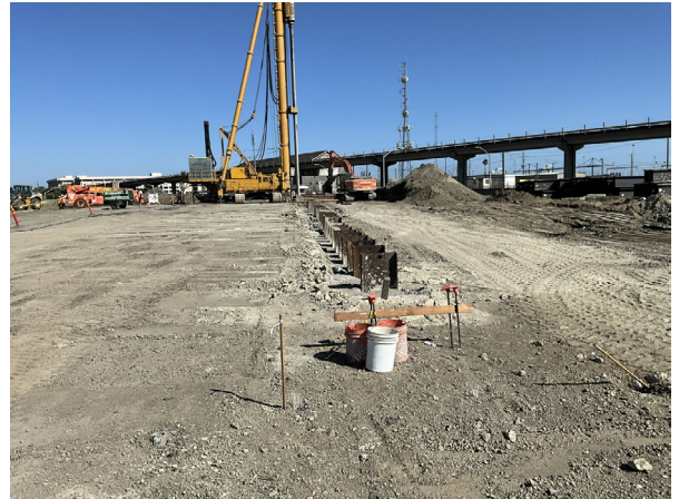
Deep Soil Mixing wall installation on east side of project.