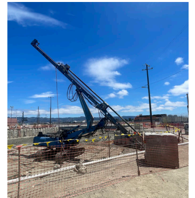
Tie back drill rig, drilling holes for tie back wall installation.