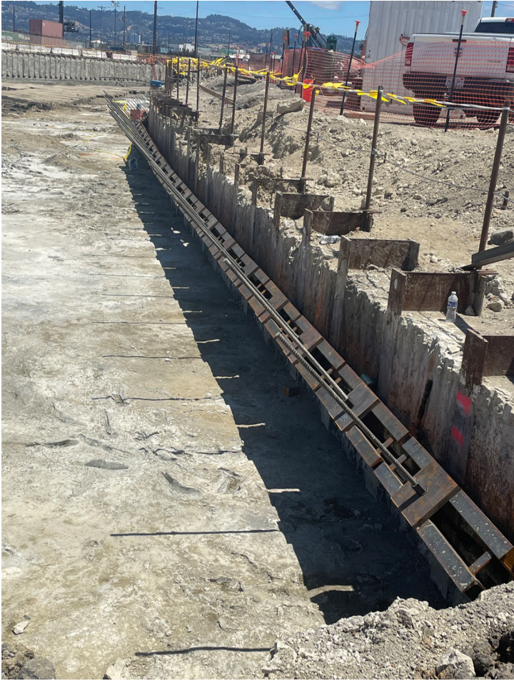
First row of tie-back installation.