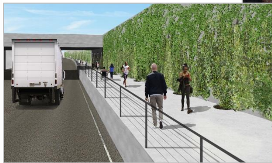
Proposed roadway and multi-use pathway (conceptual landscaping subject to input)

GoPort Updates, Overview, Fact Sheets, etc. https://www.AlamedaCTC.org/programs-projects/goport-program