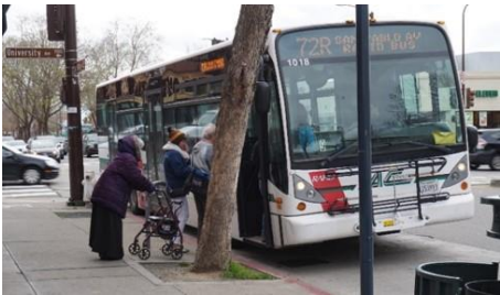
AC Transit bus along San Pablo Avenue.

The project is currently in the planning, preliminary design, and environmental clearance phase. This phase includes securing necessary approvals from Caltrans, which owns portions of San Pablo Avenue (State Route 123). The local jurisdictions have adopted resolutions in support of the concept of dedicated bus and bike lanes along San Pablo Avenue.