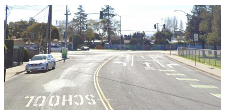
Whitman Street at Tennyson Road.