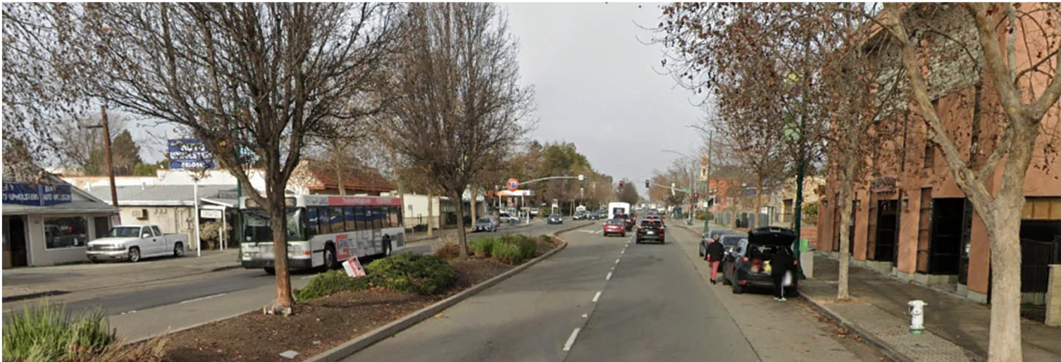
East 14th Street in Alameda County.

Note: Information on this fact sheet is subject to periodic updates.