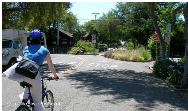
Example diverter treatment

The project is currently in the environmental clearance/final design phase.