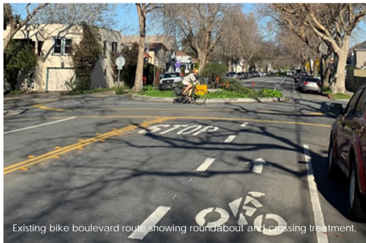
Existing bike boulevard route showing roundabout and crossing treatment.