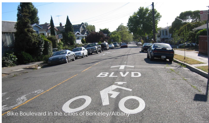
Bike Boulevard In the cities of Berkeley/Albany