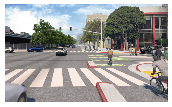
Rendering of 6th and Webster Streets.