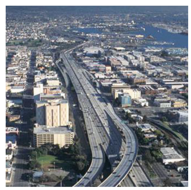
Aerial view of Oakland Alameda Access Project.