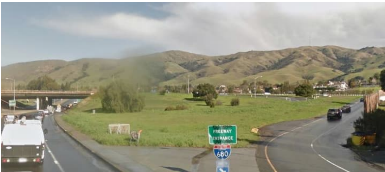
Eastbound SR-262 at the I-680 southbound on-ramp.