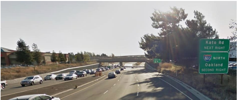
Westbound congestion along SR-262 during the afternoon commute.