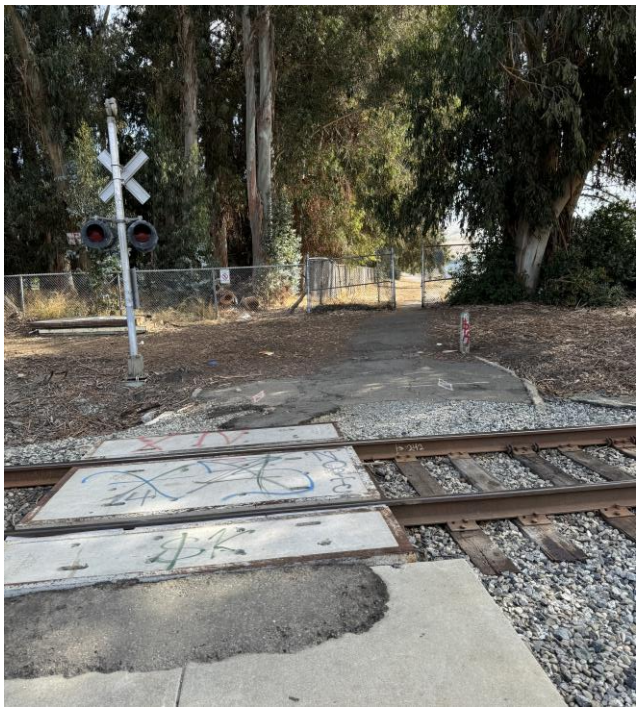
Tennyson High School Pedestrian (train track) Crossing in the City of Hayward.