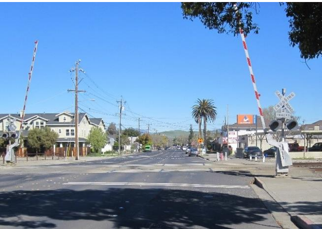
Rail crossing on L Street in the City of Livermore.