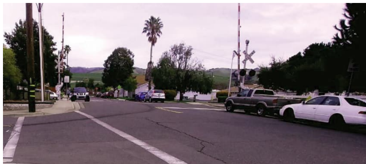
Northbound approach to the rail crossing on H Street in Union City.

Note: Information on this fact sheet is subject to periodic updates.