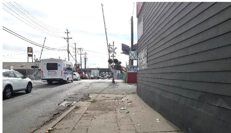
Southwest approach to the rail crossing along High Street in the City of Oakland.

Alameda CTC, Alameda County, the cities of Oakland and Union City, the California Public Utilities Commission, Union Pacific Railroad, and Caltrans