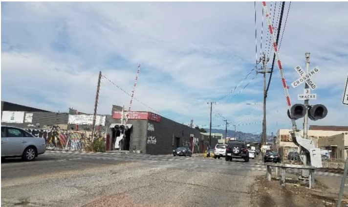
Northeast approach to the rail crossing along High Street in the City of Oakland.

Note: Information on this fact sheet is subject to periodic updates.