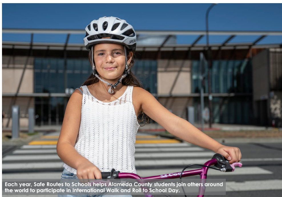
Each year, Safe Routes to Schools helps Alameda County students join others around the world to participate in International Walk and Roll to School Day.

The City of Alameda, in partnership with the Water Emergency Transportation Authority (WETA) and other organizations launched a free two-year pilot water shuttle service across the Oakland Estuary on July 17, 2024. The shuttle connects Alameda and Oakland, operating between Jack London Square and Bohol Circle Immigrant Park. The service operates four to five days per week, with peak season operations in March to October featuring up to 40 trips per day.