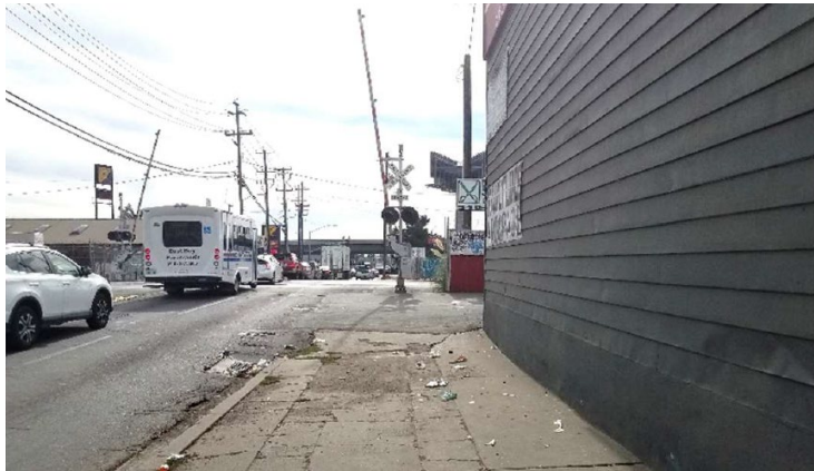
Southwest approach to the rail crossing along High Street in the City of Oakland.