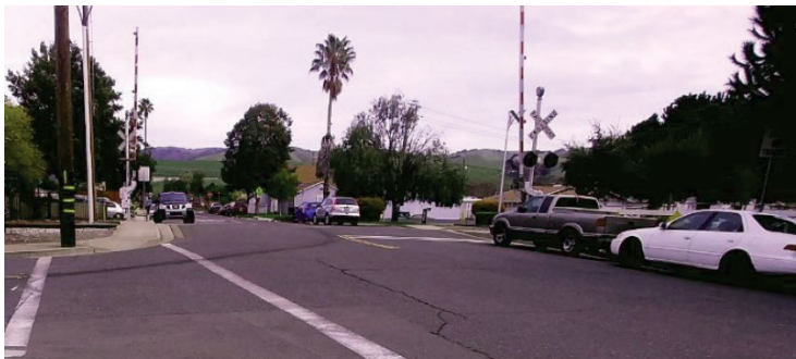
Northbound approach to the rail crossing on H Street in Union City.

Note: Information on this fact sheet is subject to periodic updates.