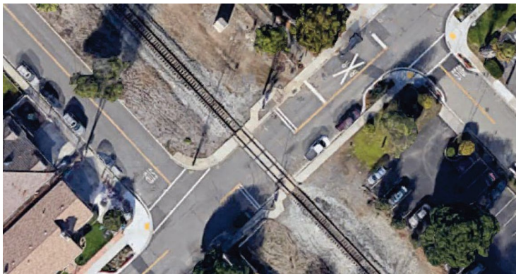
Aerial view of the rail crossing on H Street in the City of Union City.