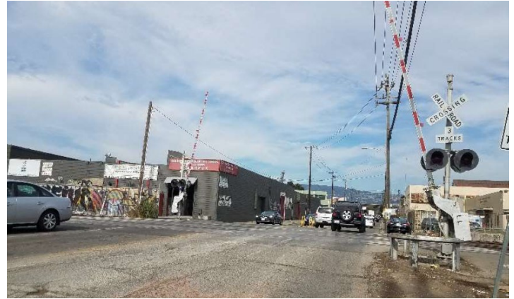
Northeast approach to the rail crossing along High Street in the City of Oakland.

Alameda CTC, Alameda County, the cities of Oakland and Union City, the California Public Utilities Commission, Union Pacific Railroad, and Caltrans