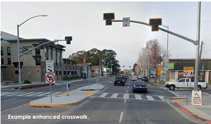
Example enhanced crosswalk.