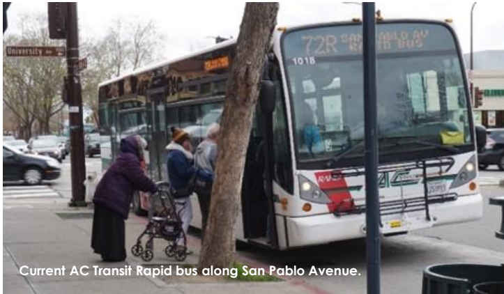
Current AC Transit Rapid bus along San Pablo Avenue.