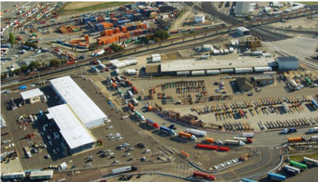
Aerial view of the Port of Oakland, March 2016.