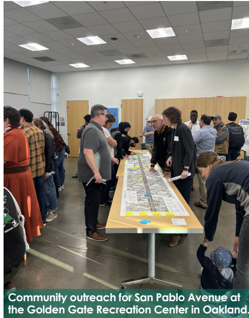
Community outreach for San Pablo Avenue at the Golden Gate Recreation Center in Oakland.

Community engagement is underway to seek input on the San Pablo Avenue Bus Lanes and Bike Lanes Project , which proposes safety and transit improvements along San Pablo Avenue in Oakland, Emeryville, and south of Heinz Avenue in Berkeley. To share the proposed design and get feedback, outreach began late last year with door-to-door outreach to all of the storefronts along the project corridor.