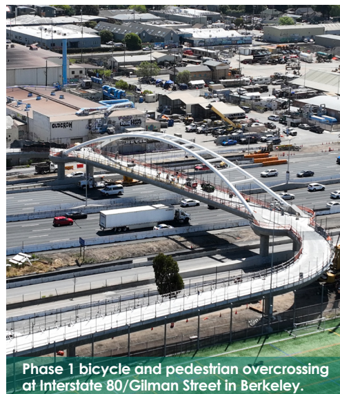
Phase 1 bicycle and pedestrian overcrossing at Interstate 80/Gilman Street in Berkeley.

The Interstate 80 (I-80)/Gilman Street Interchange Improvements (Phases 1 & 2) project is comprised of two phases that will enhance accessibility, safety, and mobility for pedestrians, bicyclists, and motorists. Phase 1, largely constructed in 2021-2023, provides a new pedestrian and bicycle overcrossing for I-80. Phase 2, which began construction in July 2022, involves the construction of a double roundabout on either side of I-80 on Gilman Street and improvements to Gilman Street. The east and west approaches to the pedestrian bridge and other associated enhancements are being constructed during Phase 2. The completion of Phase 2 will mark a significant milestone in providing safe passage for pedestrians and bicyclists over I-80 and closing a gap in the Bay Trail.