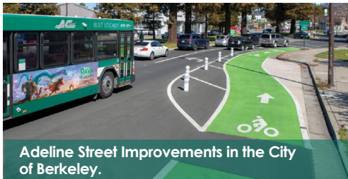
Adeline Street Improvements in the City of Berkeley.

The City of Berkeley is implementing the Adeline Street Transportation Improvements project, which is funded through Alameda CTC's sales tax and Vehicle Registration Fee. It intends to repurpose existing general-purpose vehicle lanes to create new pedestrian safety and transit operations improvements, protected bikeways, and public spaces. The project will develop preliminary engineering plans and conduct environmental analysis for multimodal improvements on approximately 0.55 miles of Adeline Street from just north of Ashby Avenue (State Route 13) to the southern city limits (King Street/62nd Street/Stanford Avenue/Martin Luther King, Jr Way).