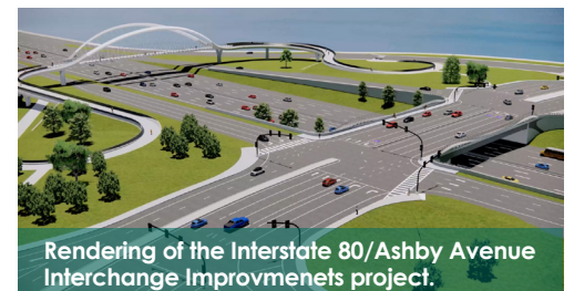
Rendering of the Interstate 80/Ashby Avenue Interchange Improvements project.

will reconstruct the current interchange at I-80/Ashby Avenue (State Route 13). It includes the construction of a stand-alone pedestrian/bicycle overcrossing across I-80 (to provide access to the Bay Trail and Point Emery) and realignment of the frontage road (to provide east-west access to the motorist vehicles and multimodal users). This project will improve safety and enhance/encourage multimodal use.