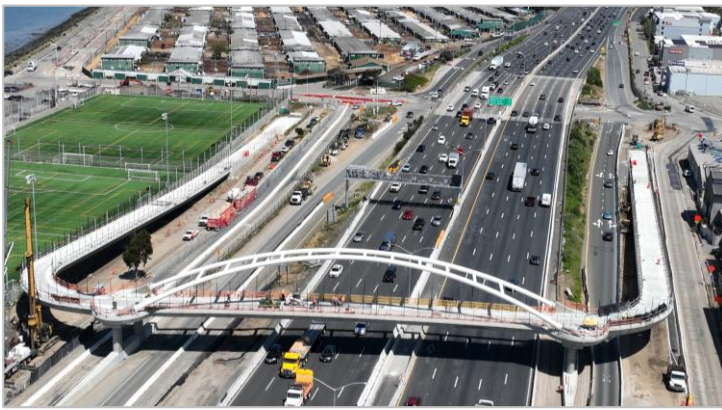
Bicycle and pedestrian overcrossing that is Phase 1 of the I-80 Gilman Interchange Improvements project.