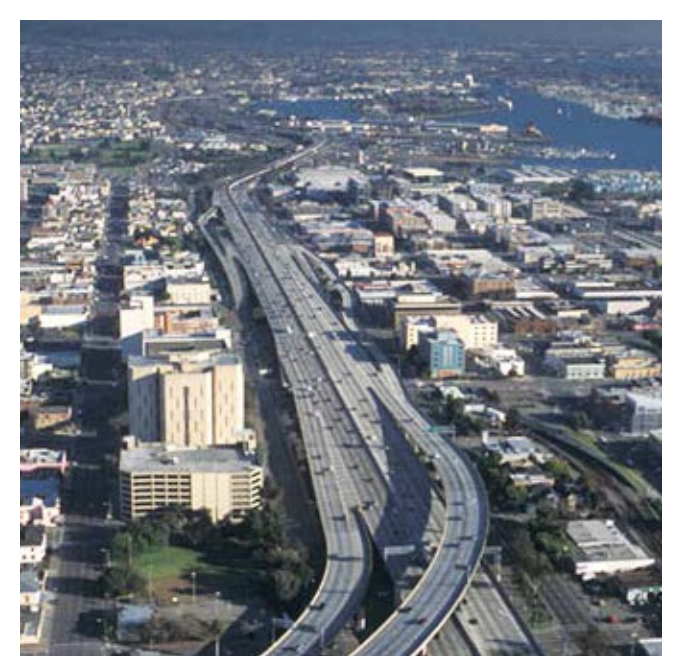
Aerial view of Oakland Alameda Access Project.