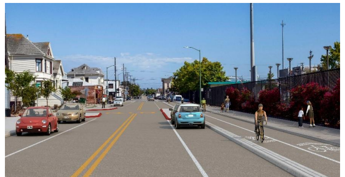
Rendering of East Bay Greenway.