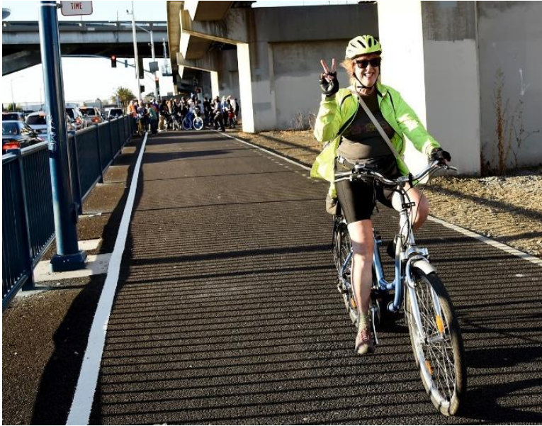
Initial East Bay Greenway segment from Coliseum BART to 85th Avenue (funded by Measure WW, TIGER and BAAQMD).