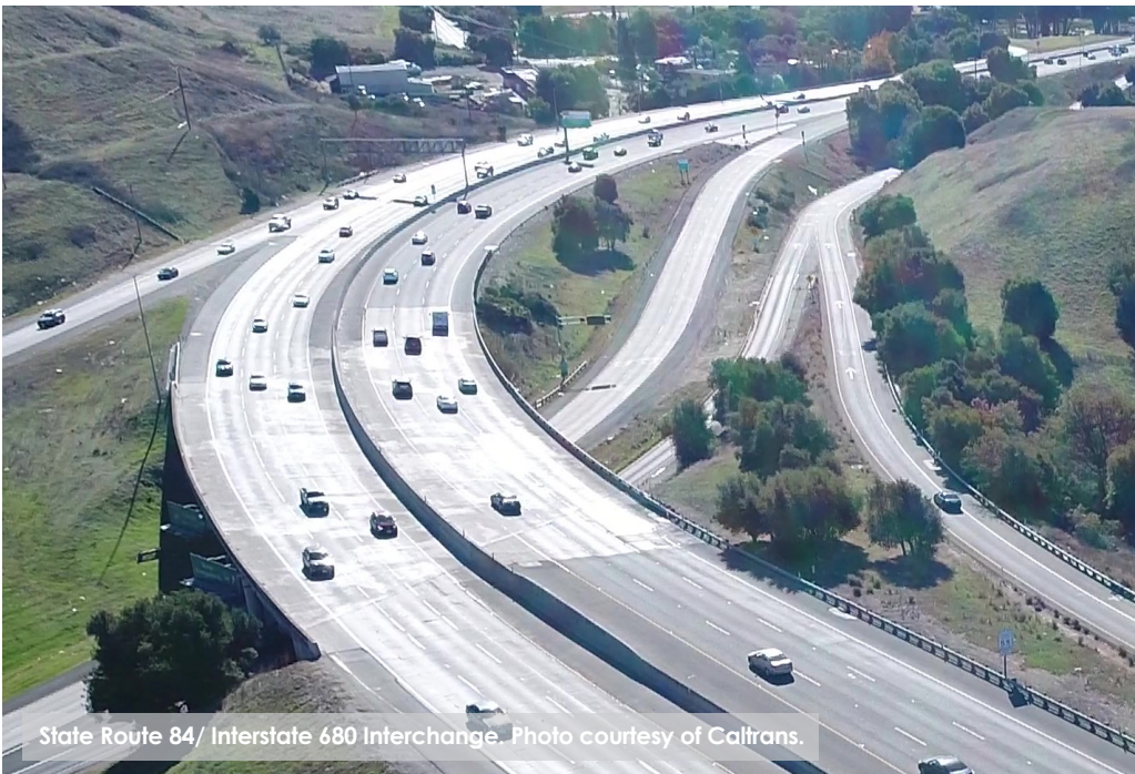
State Route 84/ Interstate 680 Interchange.