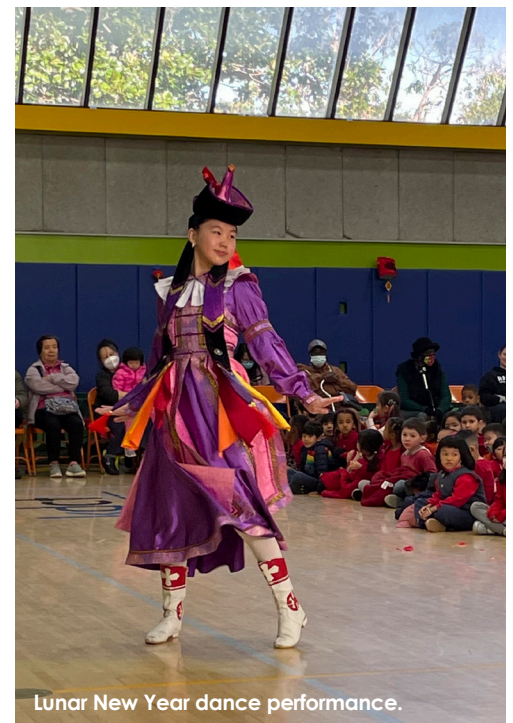
Lunar New Year dance performance.

For detail on these and other meetings, visit Alameda CTC's Meetings webpage .