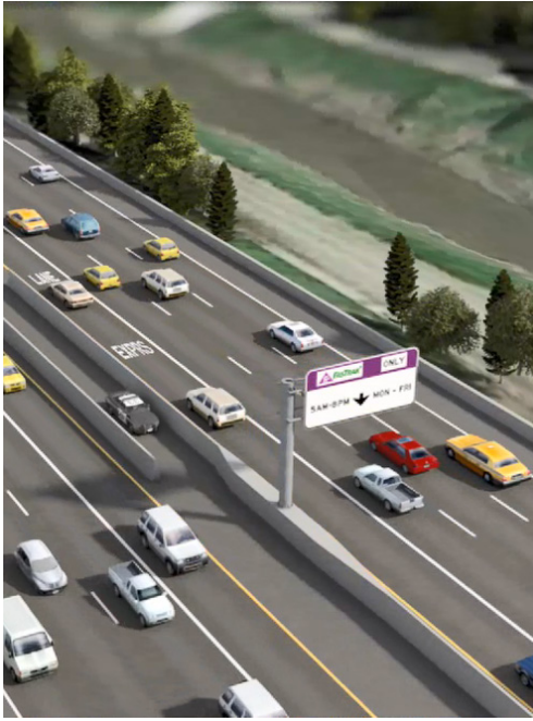
Rendering showing CHP enforcement lanes along Interstate 680 Southbound Express Lanes from State Route 84 to Alcosta Boulevard.

Funding for the project includes Measure B and Measure BB, which enabled Alameda CTC to leverage significant regional and state funds to complete the project.