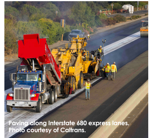
Paving along Interstate 680 express lanes.

Also along I-680, significant progress has been made on the SR-84/I-680 Interchange Improvements project on SR-84. This effort extends from south of Ruby Hill Drive to the I-680 interchange and improvements along the SR-84/I-680 Interchange itself. Initiated in May 2021, this project has made substantial advancements.