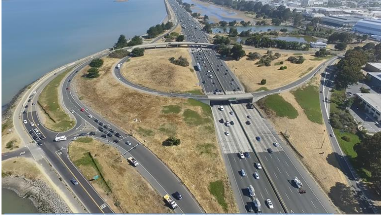
Aerial view of I-80/Ashby Avenue (SR-13) interchange.