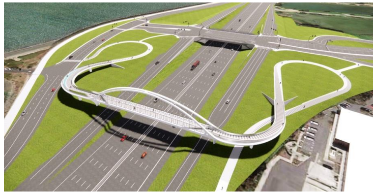
Aerial view rendering of the separated bicycle and pedestrian bridge at the I-80/Ashby Avenue (SR-13) interchange.