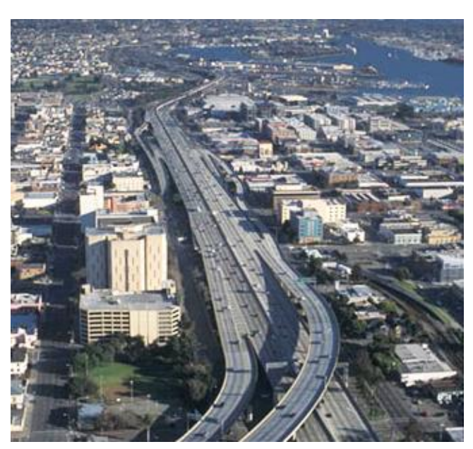
Aerial view of Oakland Alameda Access Project.