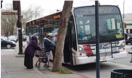
Current AC Transit Rapid Bus along San Pablo Avenue.