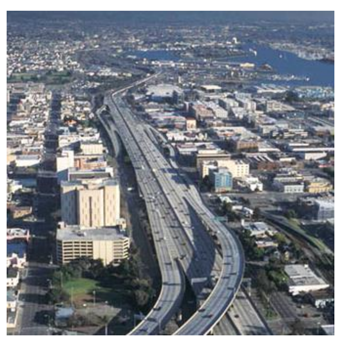
Aerial view of Oakland Alameda Access Project.