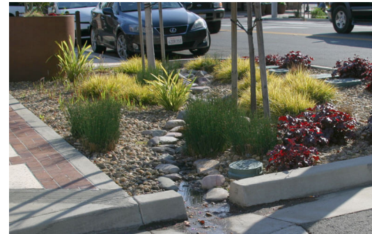
Rain Gardens and Drought Tolerant Plants