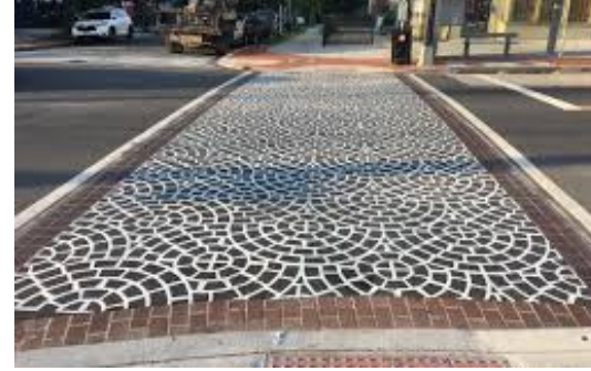
High Visibility Crosswalks