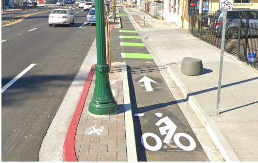
Protected Bicycle Lanes