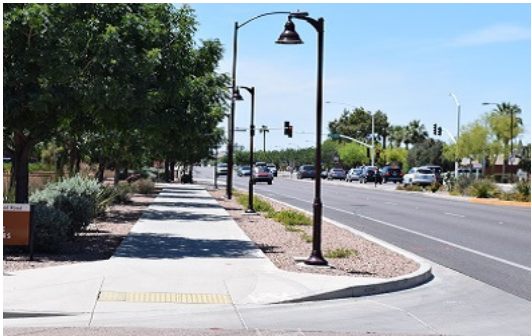
Pedestrian Scale Lighting