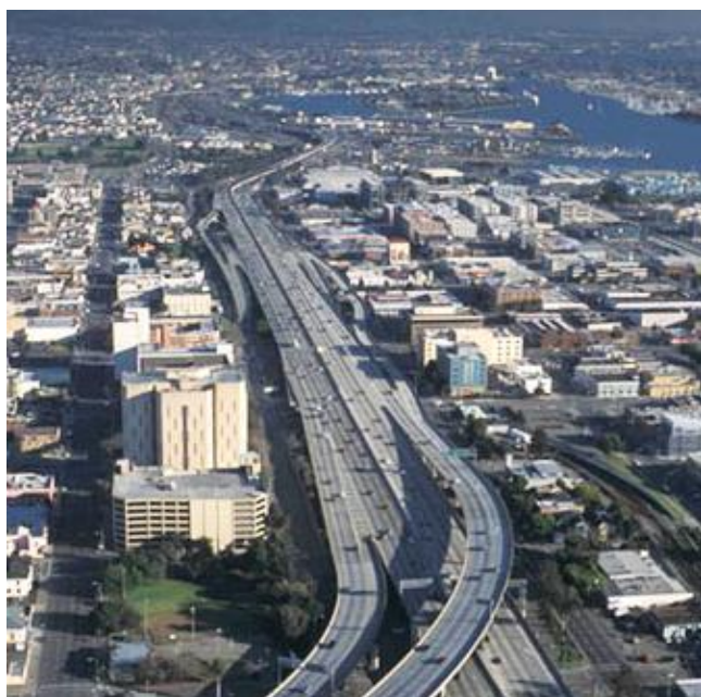
Aerial view of Oakland Alameda Access Project.