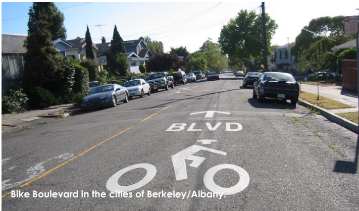
Bike Boulevard in the cities of Berkeley/Albany.