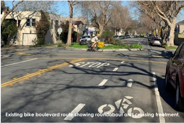
Existing bike boulevard route showing roundabout and crossing treatment.