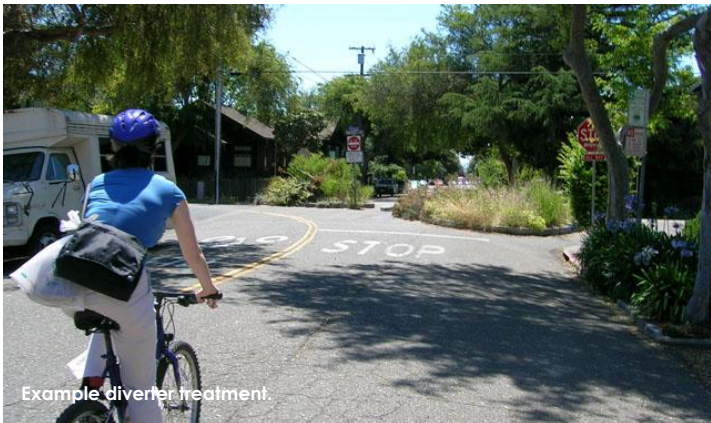
Example diverter treatment.