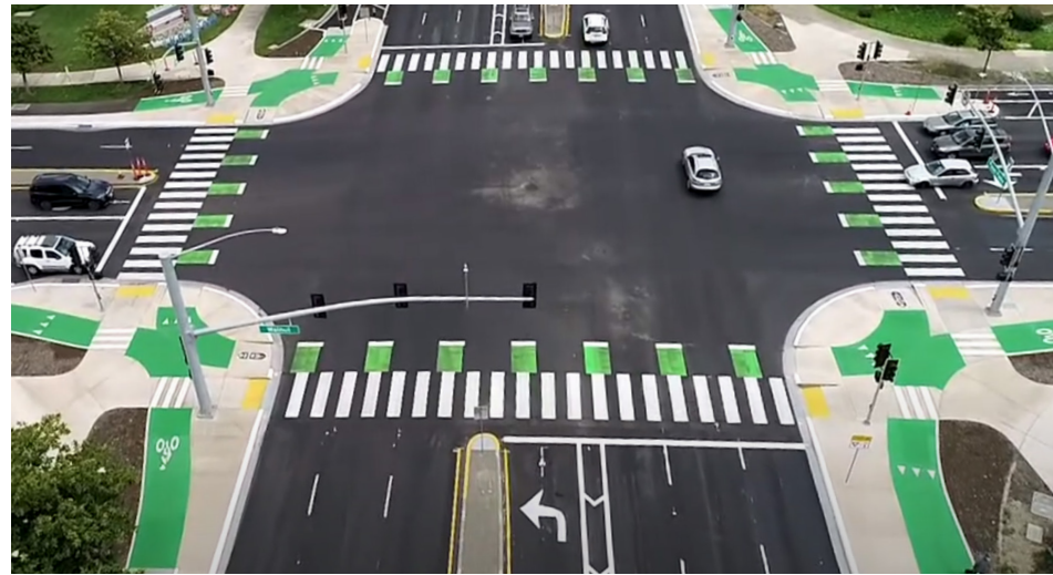
Walnut Avenue and Paseo Padre Parkway, Fremont