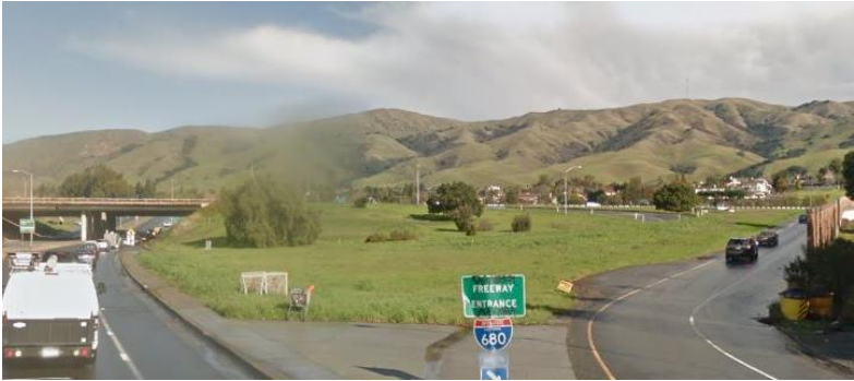
Eastbound SR-262 at the I-680 southbound on-ramp.