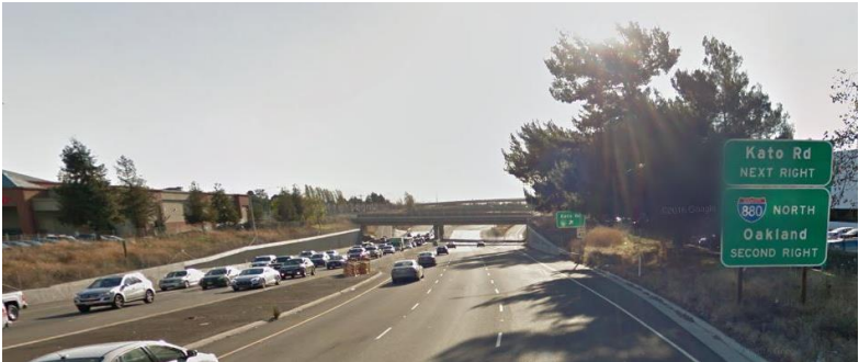
Westbound congestion along SR-262 during the afternoon commute.