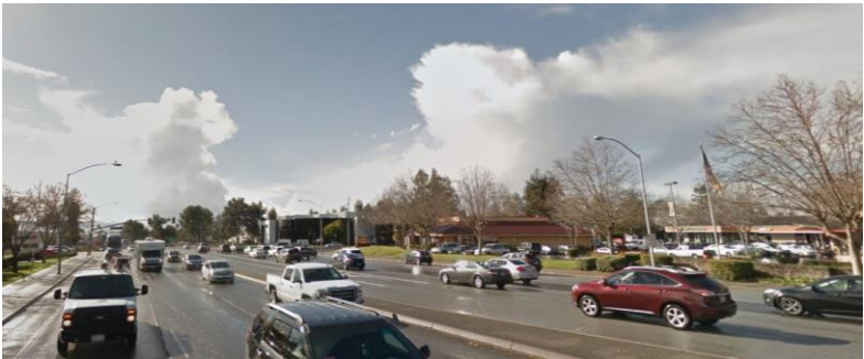
Westbound and eastbound traffic on SR-262 in Fremont.