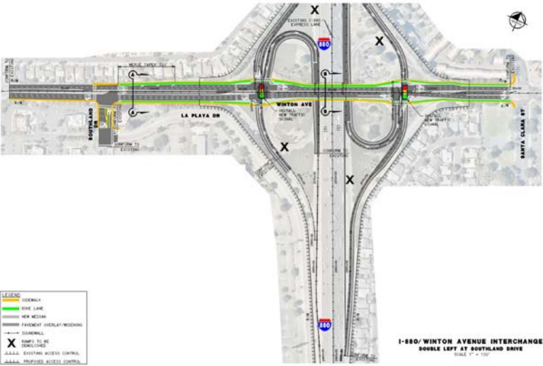
Preliminary interchange geometric at the I-880/Winton Avenue interchange.