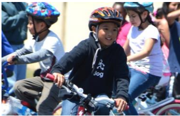
Thousand of Alameda County students participate in countywide events each year, including International Walk and Roll to School Day, the Golden Sneaker Contest, and Bike to School Day.