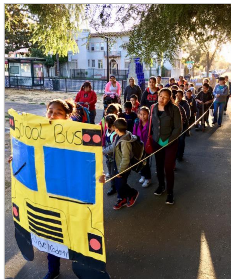
Students walk together in a Walking School Bus at Achieve Academy in Oakland, Calif.