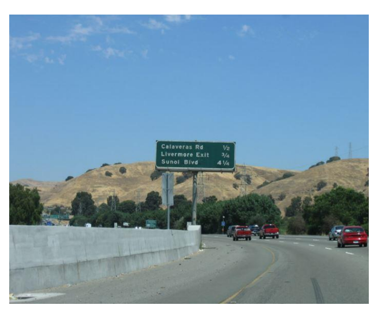
I-680 northbound approaching the Calaveras Road off-ramp.