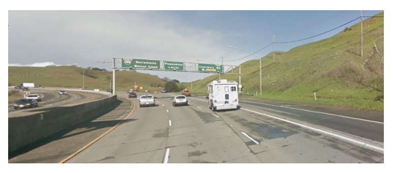
I-680 northbound approaching the SR-84 off-ramp in Sunol.