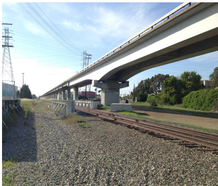
Project corridor in San Leandro south shared by UPRR – an active freight rail line.