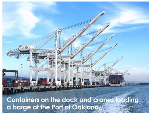
Containers on the dock and cranes loading a barge at the Port of Oakland.

The Alameda County Transportation Commission (Alameda CTC), in partnership with the Port of Oakland and City of Oakland, is working on a suite of transportation improvement projects known as the GoPort Program —Global Opportunities at the Port Of Oakland. In May 2023, Alameda CTC awarded the $193 million construction contract for the 7th Street Grade Separation East (7SGSE) project. The 7SGSE project improvements will increase efficiency and reliability of goods movement operations, improving competitiveness of the Port, enhance safety and incident response capabilities, and improve truck throughput for the Port along 7th Street between Maritime Street and Bay Street Circle.