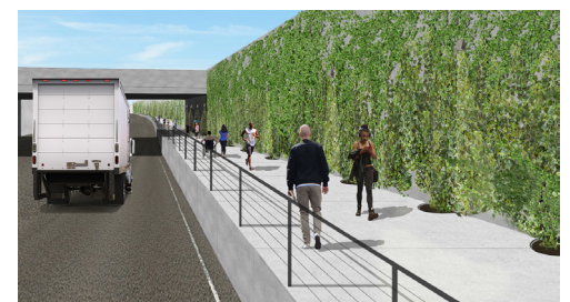
Rendering of the proposed 7th Street westbound approach to the Union Pacific Railroad bridge.

Articles detailing project benefits can be found in both the East Bay Times and San Jose Mercury News . More information about this and other Alameda CTC projects can also be found on the agency's Projects webpage .