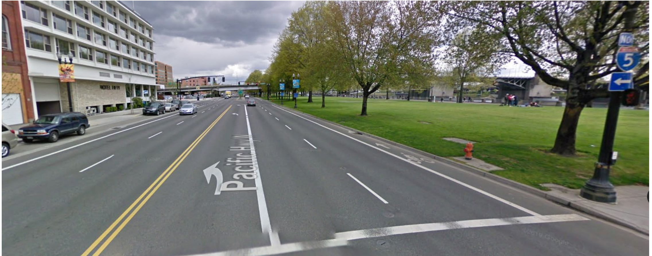
Google Streetview Image of SW Naito Pkwy at SW Yamhill St, Looking North (2009)