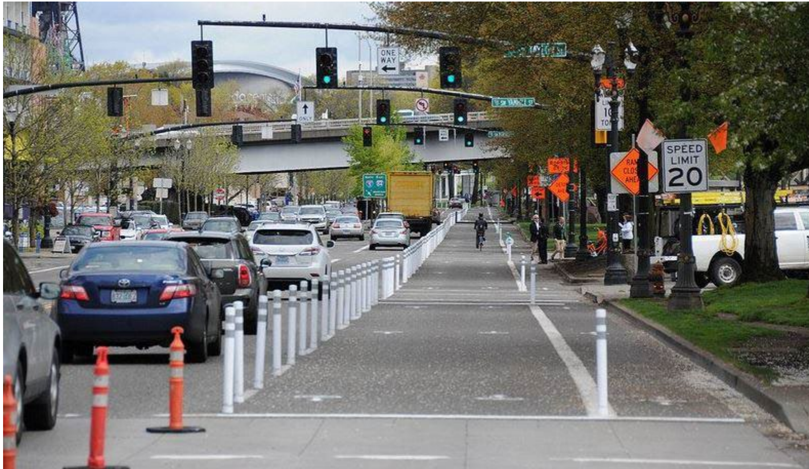
Seasonal Better Naito Configuration