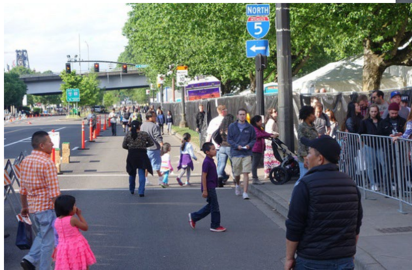
Festival Entrance During Pilot