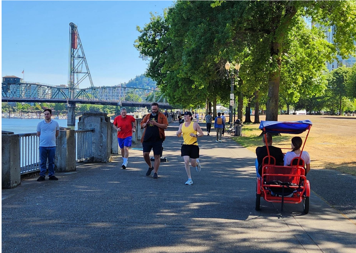
Typical Waterfront Path Congestion

City will install signs in Waterfront Park to discourage unsafe riding