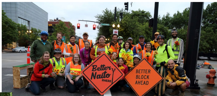
Better Block Volunteers