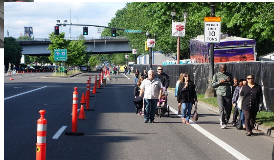
Non-Entrance During Pilot