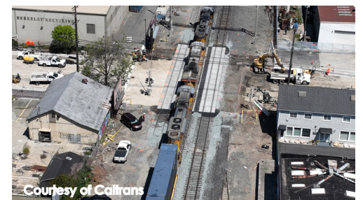
Construction at rail crossing on Gilman Street.

More information about this and other Alameda CTC projects can also be found on the agency's Projects webpage .