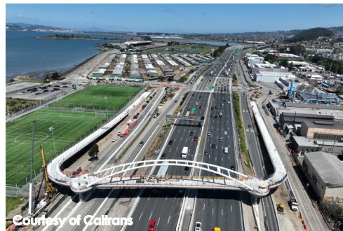
Pedestrian and bicycle overcrossing at the Interstate 80/Gilman Street interchange.

The Alameda County Transportation Commission (Alameda CTC), in partnership with the California Department of Transportation (Caltrans) and the City of Berkeley, currently has both phases of the Interstate 80 (I-80) Gilman Street Interchange Improvement Project under construction. Phase 1 of the Gilman Street interchange includes construction of the Pedestrian and Bicycle Overcrossing (POC). The bridge fencing and lighting are currently being installed. Phase 2 construction has been underway for nearly one year. It includes the construction of bicycle and pedestrian improvements along Gilman Street, upgrades to the at-grade rail crossing and operational improvements with the construction of roundabouts at the ramp terminal intersections.