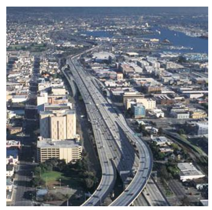
Aerial view of Oakland Alameda Access Project.