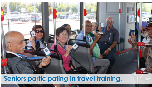
Seniors participating in travel training.

The United Seniors of Oakland and Alameda County (USOAC)'s Senior Public Transportation Training and Education Program aims to make public transportation more accessible for senior communities throughout Alameda County. The program includes travel training for seniors that teach skills such as trip planning, using Clipper and Regional Transit Connection Cards, transferring