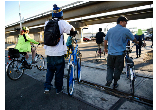
Crossing over rail tracks to reach the East Bay Greenway regional trail on the other side of the BART overpass.

Once completed, this project will reduce congestion, improve travel time reliability, reduce greenhouse gas emissions, increase throughput, and improve safety and accessibility.