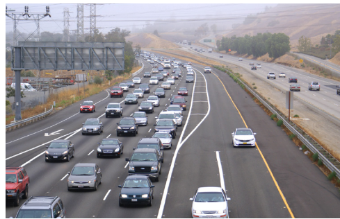
Interstate 680 southbound.

Breadth of activity at Alameda CTC demonstrates efficient project delivery