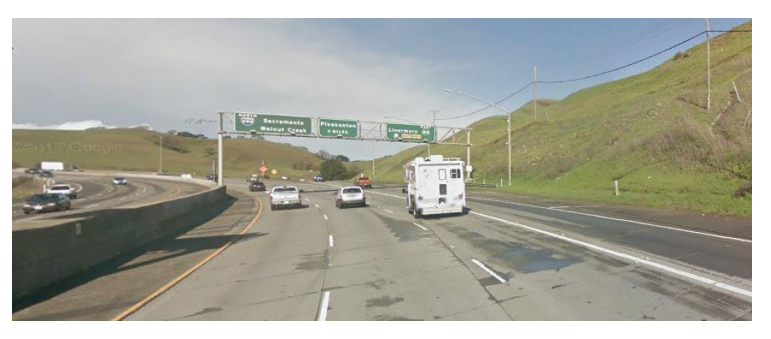
I-680 northbound approaching the SR-84 off-ramp in Sunol.