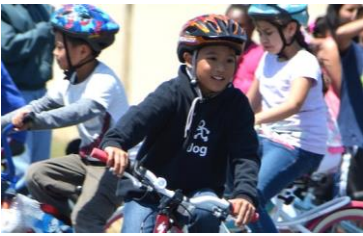
Thousand of Alameda County students participate in countywide events each year, including International Walk and Roll to School Day, the Golden Sneaker Contest, and Bike to School Day.