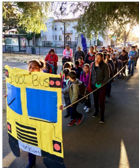
Students walk together in a Walking School Bus at Achieve Academy in Oakland, Calif.

The Alameda County SR2S Program promotes safe and healthy transportation choices for parents and children throughout Alameda County.