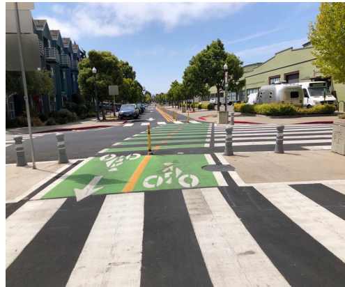
Emeryville's Doyle Street Greenway, one of 13 Alameda CTC quick-build bicycle and pedestrian projects, a multi-use path that is a part of the countywide bikeway network.

In December 2022, the Commission approved an All Ages and Abilities Policy and a set of Design Expectations for the Countywide Bikeways Network, which creates a vision for a high-quality, 400-mile network of safe and comfortable bikeways on corridors of countywide significance.