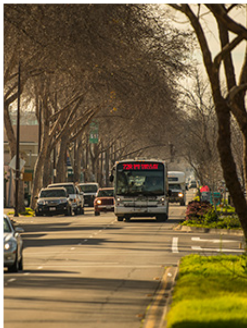
AC Transit's Line 72 bus traveling along San Pablo Avenue in Berkeley.

The multi-year planning and project development effort for San Pablo Avenue has advanced into the next stage of design. In December, staff initiated targeted community engagement to gather input on specific near-term safety and transit improvements under development San Pablo Avenue and parallel streets in Albany, Berkeley and North Oakland as part of the corridor's Safety Enhancements and Parallel Bike Improvements projects. Users of the San Pablo Avenue corridor experience the third-highest number of bicycle and pedestrian collisions resulting in fatal and severe injuries in the county. This project will improve the safety for pedestrians and bicyclists crossing San Pablo Avenue and improve transit speed by installing high visibility crosswalks, flashing beacons, pedestrian signals, median refuge islands, upgraded lighting, accessible curb ramp upgrades, bulb outs at Rapid bus stops, and bus stop relocations. To view a detailed map of proposed improvements and provide input on this major transit route, please visit alamedactc.org/sanpablo .