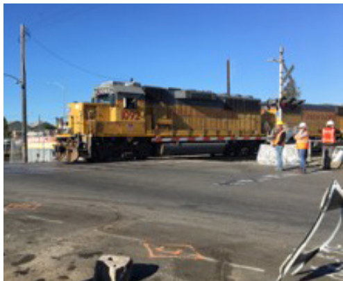
Existing rail crossing along 37th Avenue in the City of Oakland.

An e-blast was also sent at the end of December to update the community about the upcoming construction and provide project contact information. The project construction contract was advertised January 3, 2023, and a mandatory pre-bid meeting was held on January 18, 2023.